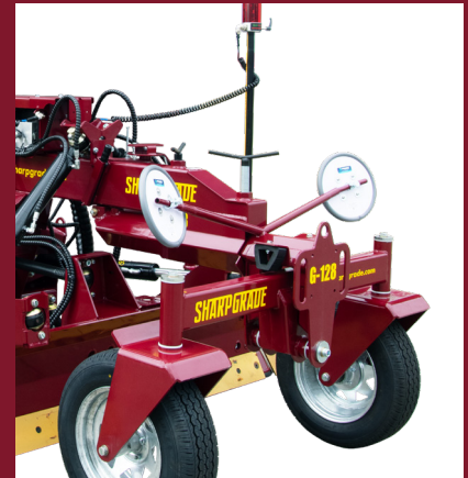
Telescopic retracting wheels for confined space / transport