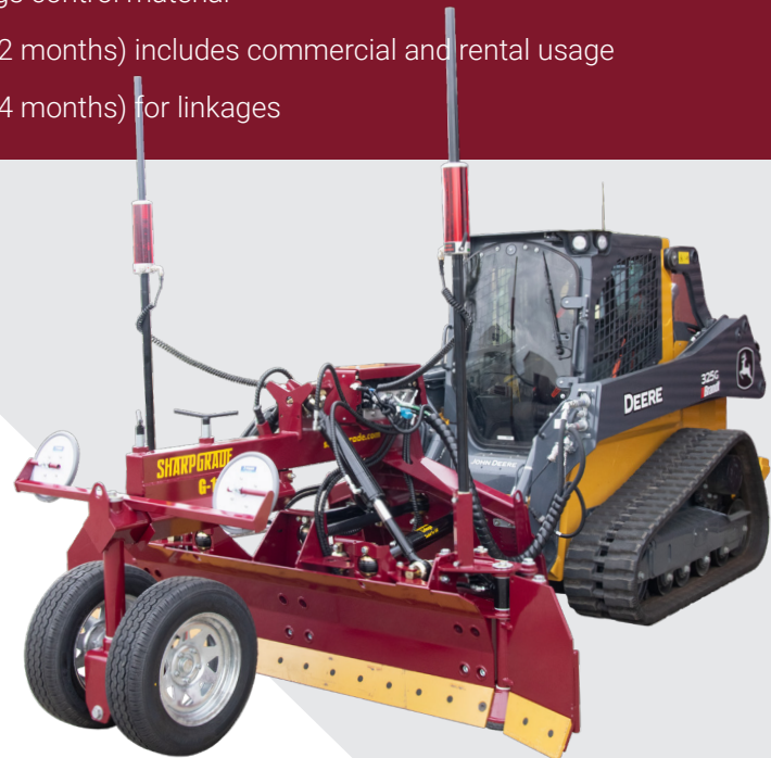
Robust hydraulic wings grade in either direction