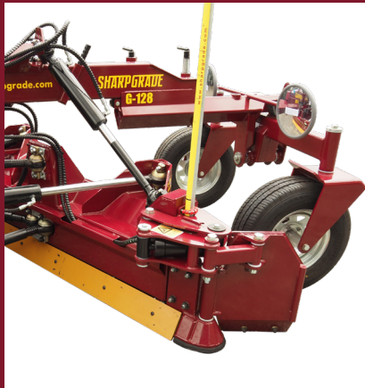
Rear blade to precision grade in reverse