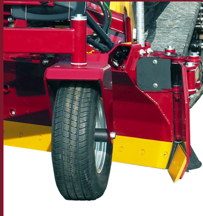
Hydraulic wings control material in both directions